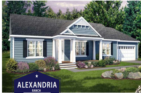
ALEXANDRIA RANCH 3 bed-2 bath | 1434 sq. ft.